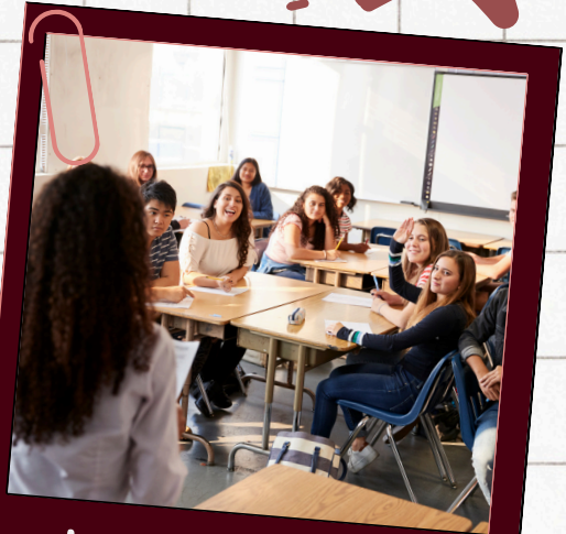
Class of 2026